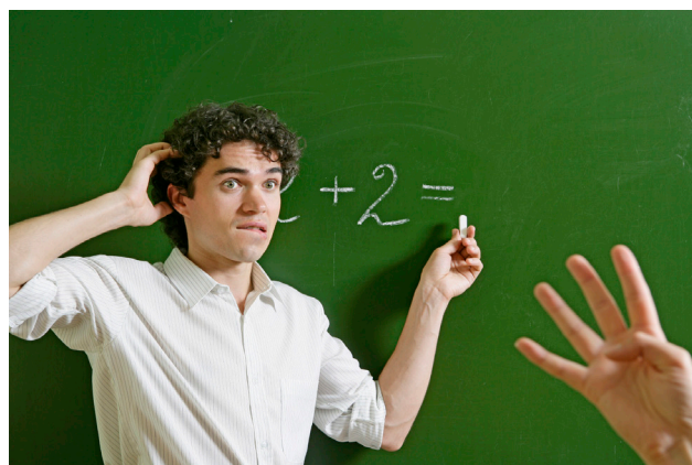
Many of us can struggle with maths and numbers

Numbers can not only be tricky when assessing risk, but also challenging for the tree owner or manager. They often struggle to make sense of risk outputs as probability fractions, such as 1/3 000, 1/40 000, or 1/500 000. More importantly, there's too much uncertainty in tree risk assessment to reasonably claim a level of accuracy to one significant figure, like 1/20 000. Or to be able to tell the difference between a 1/20 000 risk and a 1/50 000 risk with enough certainty to justify the difference between them.