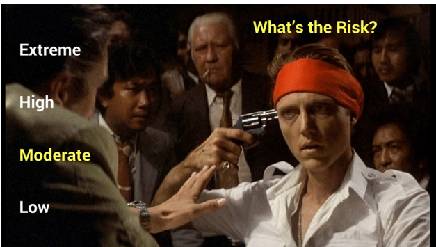
Russian roulette - The Deer Hunter

If you're unfortunate enough to be playing a game of Russian roulette with 'The Deer Hunter' rules, you might be surprised and relieved to find that the first round is only a Moderate risk according to TRAQ. If you're still alive by round five you'd be astonished to find that the risk is still just Moderate. It's only if you make it to round six, when you're going to shoot yourself in the head that the risk increases to become both High AND Extreme at the same time. Why is such an obviously extreme risk being rated as Moderate by TRAQ?