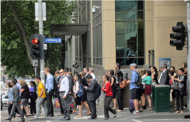
Occupancy greater than 'constant' in words or '1/1' in numbers is common

The answer is yes, if it sorts out those problems we've looked at in this article, and more that there wasn't the space to cover. Whether you're assessing or managing tree risk, here's how VALID gives you a helping hand. VALID takes a 'best of both worlds' approach that works on the strengths and ditches the weaknesses when measuring risk with words or numbers. That means collaborating with an independent maths professor who's an expert in measuring risk in the natural environment to model what you're trying to measure, so that it's credible and realistic. Define categories that are just right and neither too wide, nor too narrow. Where necessary, embrace imprecision. Describe the likelihood of occupancy and consequence categories so that you don't need maths, and they can easily be understood and recognised when you're out in the field. Have risk outputs that are believable, that are not too vague or misleadingly accurate. Then test the model for uncertainty and user error to check its resilience.